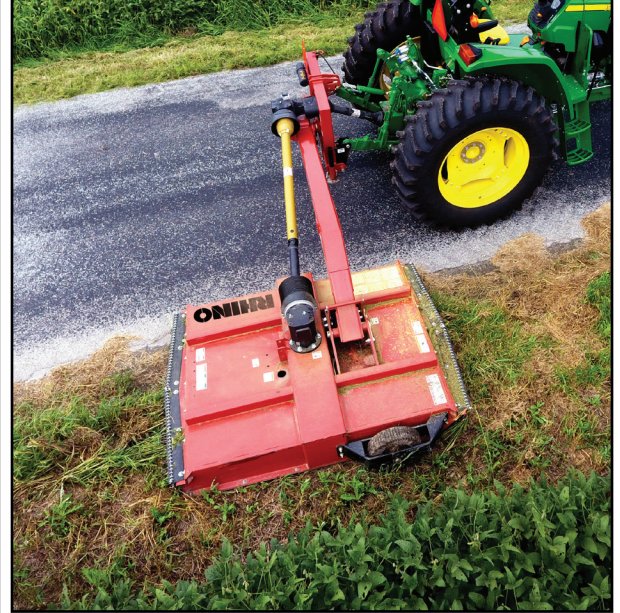
Shown with Extra Equipment