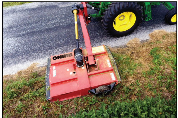
Shown with Extra Equipment